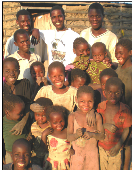
The children of Zambia are a source of great joy and inspiration to our missionary Sisters.