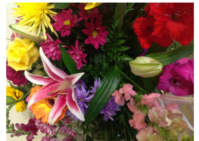
Beautiful flowers adorned for the Church for the celebration