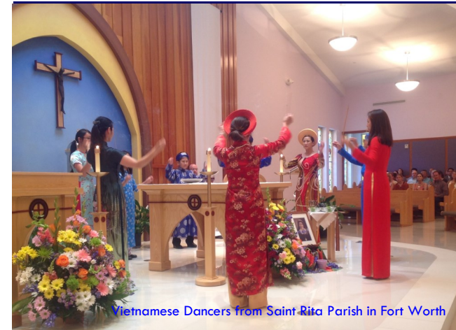
Vietnamese Dancers from Saint Rita Parish in Fort Worth