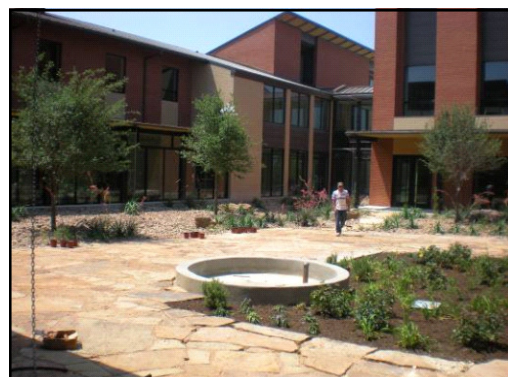
New Motherhouse Work-in-Progress: Xerioscape Courtyard

maculate are committed to promoting the health and well-being of all people as well as of the planet.