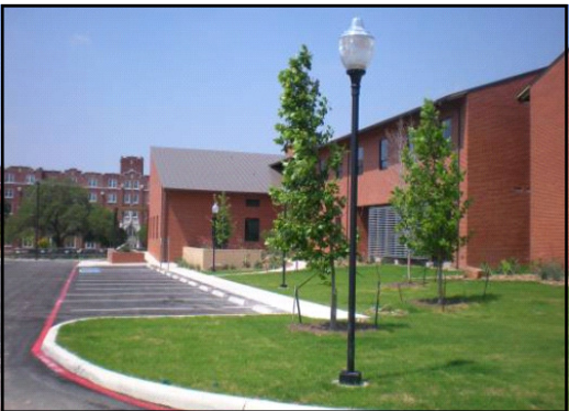
The new, almost finished motherhouse with the original motherhouse in the background.

In this issue we want to acknowledge the many benefactors who have supported, and continue to support us in our ministry and mission work, in the building of our new facility, and in caring for our frail elderly Sisters. We are truly humbled by your generosity in such