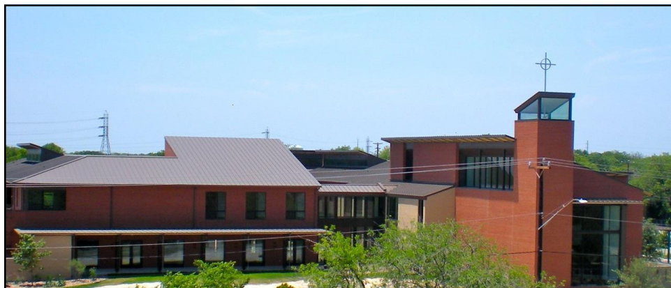
Our New Motherhouse — as photographed from the roof of the original Motherhouse

The Sisters of the Holy Spirit and Mary Immaculate