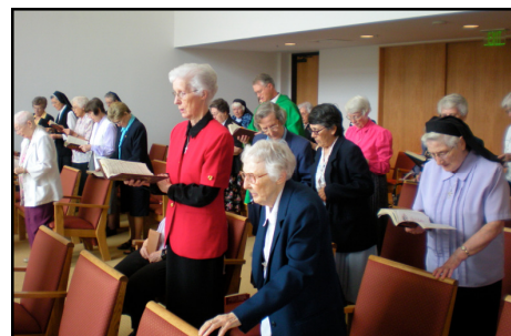
Sisters and visitors participate in prayer together in the community chapel..