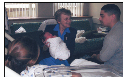
Post-Partum care includes spending time with new mothers and fathers.